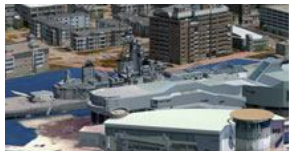
Virtual world with 40 high-detail cities and more than 24,900 airports