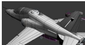
Customizable, data driven graphics and models