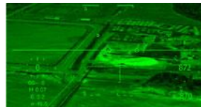
Night vision and infrared sensors