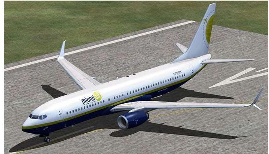
Freeware TDS Boeing 737-800 (notice the new scimitar winglets and slightly different body shape)