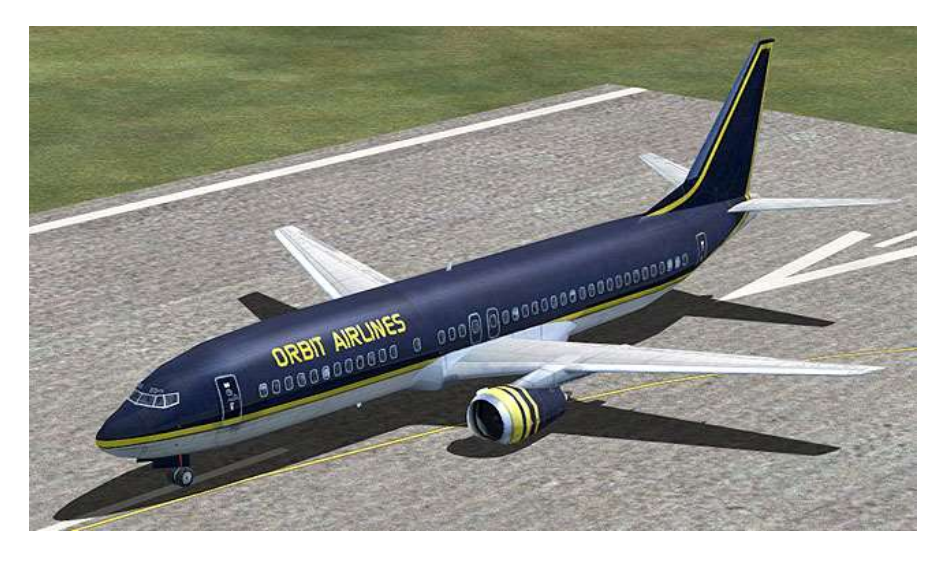
Default FS2004 Boeing 737-400

On July 9th, 2014, Dovetail Games (who were known for Train Simulator 2015 at the time) announced that they had bought the full rights from Microsoft, which granted them the rights to develop the next flight simulator. Later that year in December, FSX: Steam Edition was released at the Steam store. This was a slightly modified version of FSX: Gold Edition, Deluxe, Acceleration and both service packs pre-installed. It also replaced the GameSpy multiplayer system (which had since shut down) with the Steam multiplayer system.