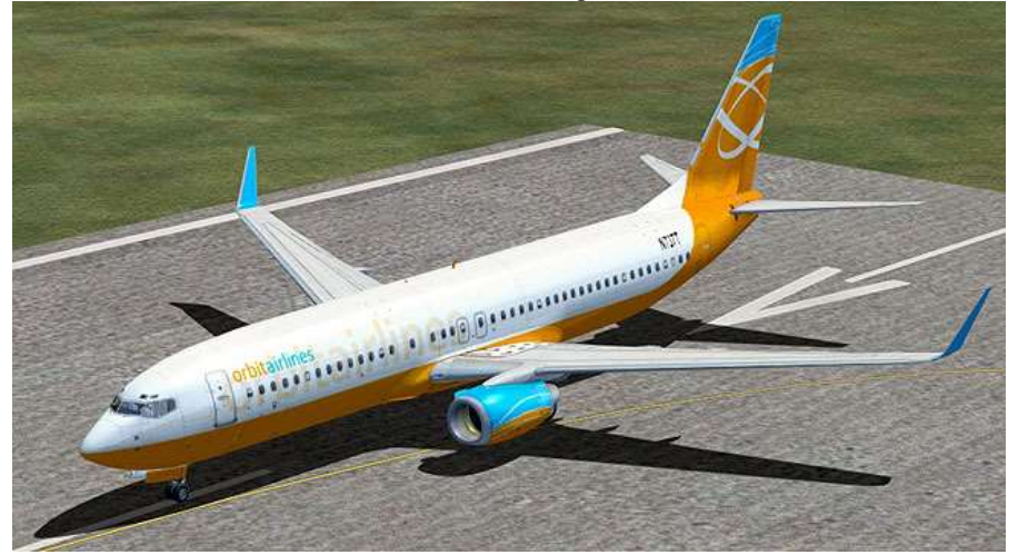
Default FSX Boeing 737-800