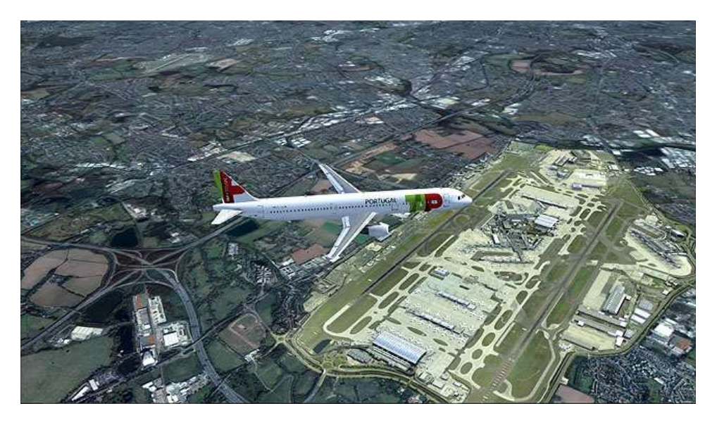
UK2000 Heathrow Extreme with VFR Scenery and Wilco Airbus Evolution A321.